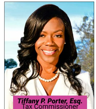
Tiffany P. Porter, Esq. Tax Commissioner

If you do not owe the fine, you can apply to have it removed by downloading and completing the "Insurance Fee Waiver Form" from the homepage of my website – GwinnettTaxCommissioner.com , and emailing a copy of the completed form and a copy of your valid driver's license to tag@gwinnettcountry.com .